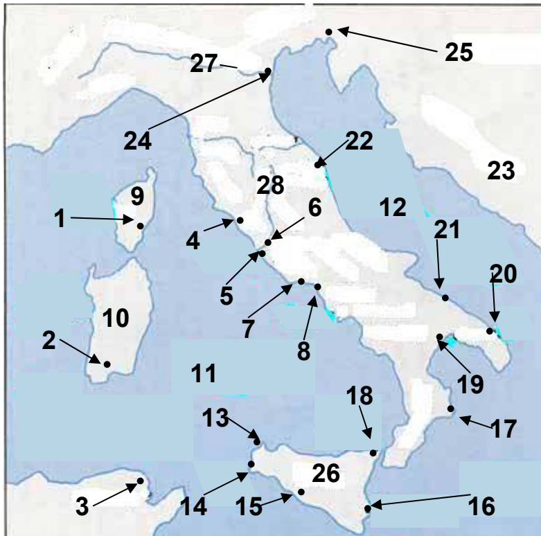
Figure 2 . Map of ancient Italy

Select the number from Figure 2 that most closely represents the listed feature.